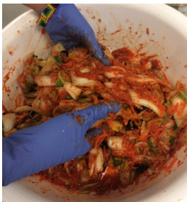
Fermentation workshops include learning how to make kimchi.