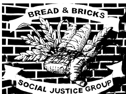
DPCM joins Bread and Bricks continues to meet 1-3pm Thursdays