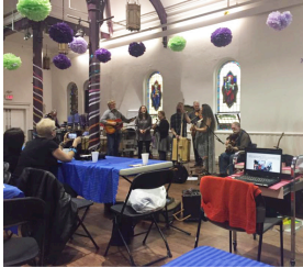
Beat the Winter Blues returned and featured North of Queen among other performers.